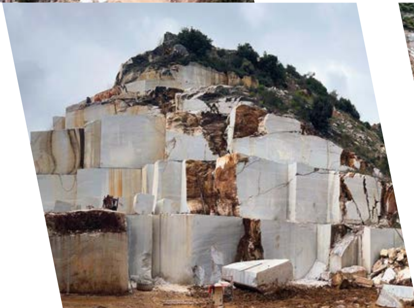
SILVER CLOUD \ EXCLUSIVE ACCESS