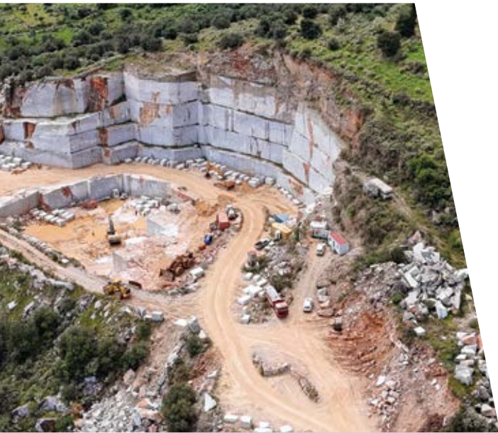
ALIVERI GRIGIO \ OWNED QUARRY