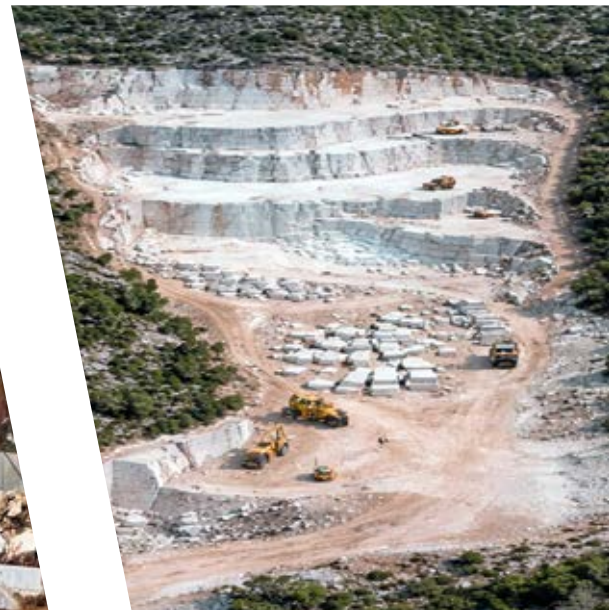
VANILLA WHITE \ EXCLUSIVE ACCESS